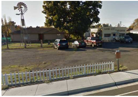
November 2010, before we opened.

We're also starting to work on the front. The first step is to clean up the area by the white picket fence. We'll be putting in some ground cover and bark—a low cost project that will give it some color and make it look more finished. We'll also clean