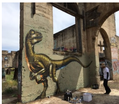
The iconic dinosaur from last year's Graffiti Art Tour at the Ruins, part of Arts in April.

Historically, the Visit Napa Valley tourism organization was the primary financial backer for the event, so the focus was on attracting visitors to the Napa Valley. This year, Arts Council Napa Valley will be the lead agency promoting the program, and the