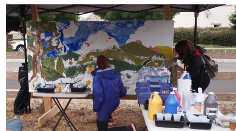
Kids painting

popular Artwall; the Lions Club provided a hot dog lunch, and the Kiwanis organized hikes up to the Preserve.